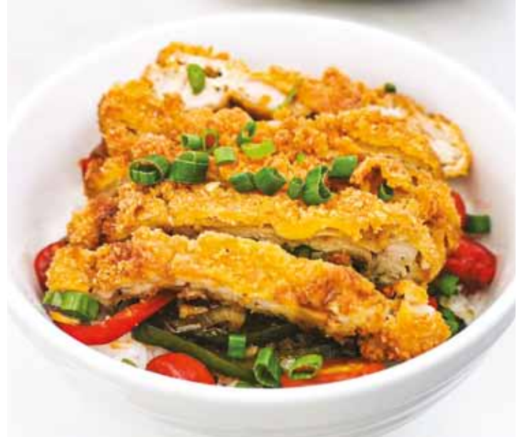
BREADED CHICKEN BOWL M : RM24.00 | NM : RM30.00