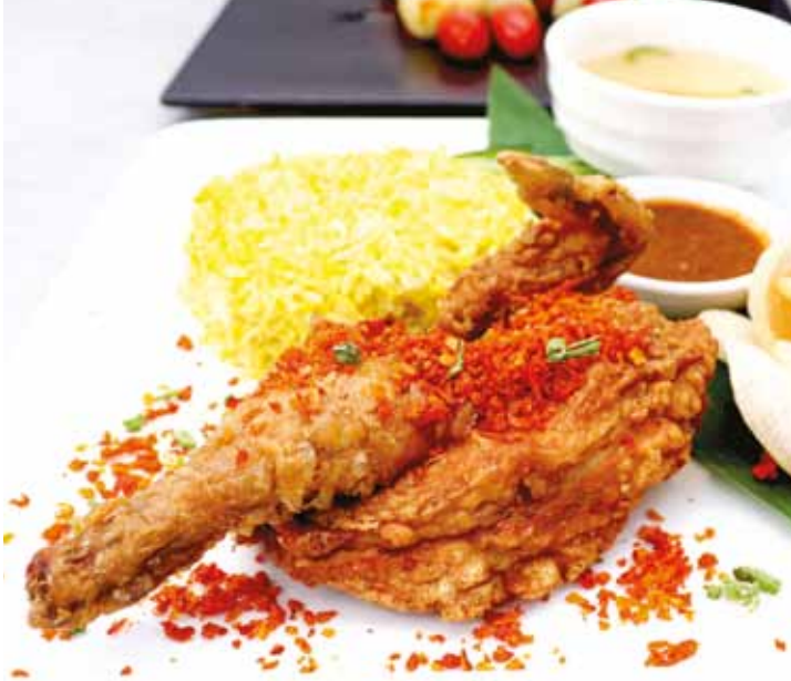
SZECHUAN SPICY CRISPY SPRING CHICKEN M : RM22.50 | NM : RM28.00