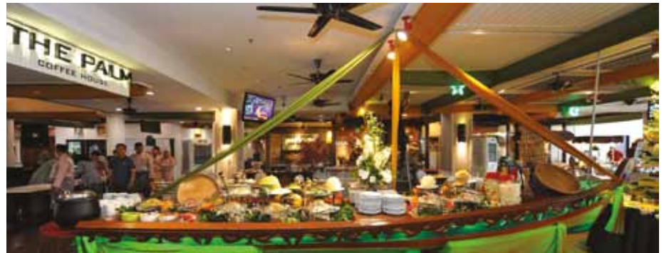
The main buffet line was spread across a makeshift sampan