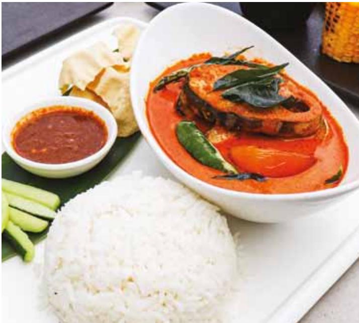
GULAI IKAN TENGGIRI M : RM25.00 | NM : RM31.50