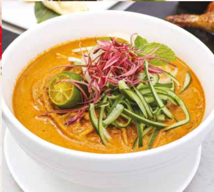
LAKSA JOHOR IKAN TENGGIRI M: RM21.00 | NM: RM26.50