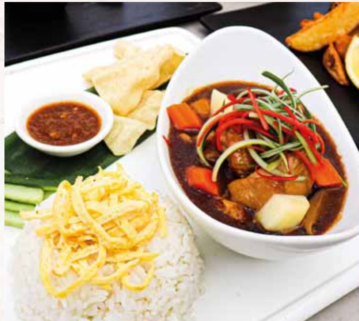
NYONYA CHICKEN PONGTEH WITH POTATOES AND BLACK BEAN PASTE M: RM23.00 | NM: RM29.00