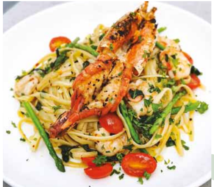
SHRIMP SCAMPI PASTA M : RM55.00 | NM : RM69.00