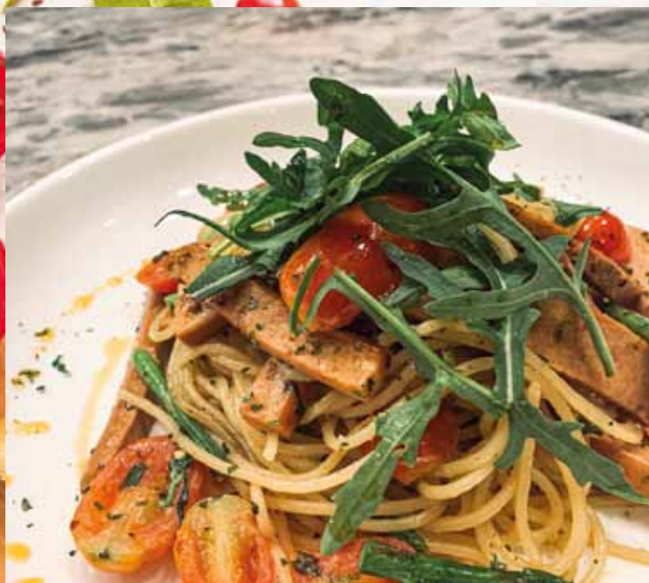
AGLIO OLIO CHICKEN JALAPENO PASTA M: RM26.00 | NM: RM32.50