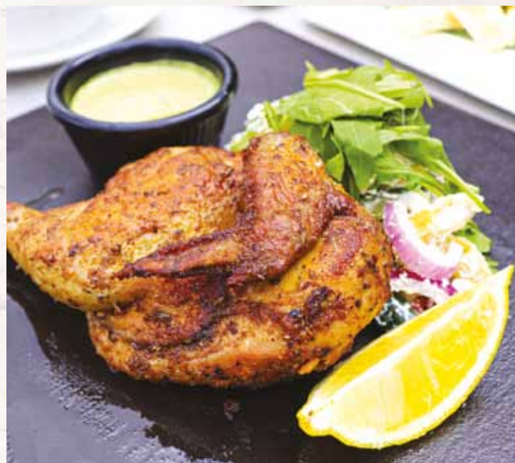
BAKED SPRING CHICKEN SERVED WITH COLD SALAD AND PERI PERI SAUCE M: RM28.00 | NM: RM35.00