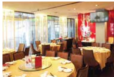
Spring Garden Chinese Restaurant

LG, Sports Wing Tel: 03 7804 8888 ext 327 Closed on Mondays Tues - Fri: 4pm - 7pm Sat, Sun & PH: 7pm - 8pm