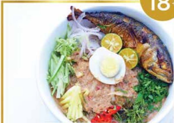
LAKSA UTARA IKAN SEEKOR SPECIAL