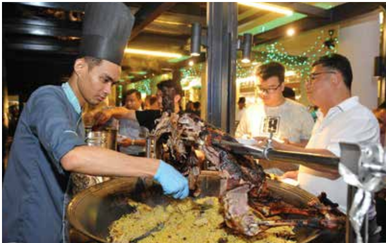
Guests eagerly awaiting at the Nasi Briyani Kambing station