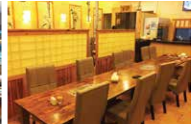
Myeong Dong Korean BBQ Restaurant

GF, Palms Wing Tel: 03 7805 3835 Mon - Fri: 3pm - 11pm Sat - Sun: 10am - 11pm