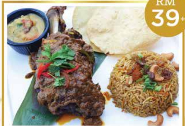
LAMB SHANK BRIYANI