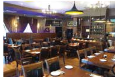
J Italian Restaurant

LG, Sports Wing Tel: 03 7804 8888 ext 327 Mon - Fri: 5pm - 1,30am Sat - Sun: 5pm - 12am