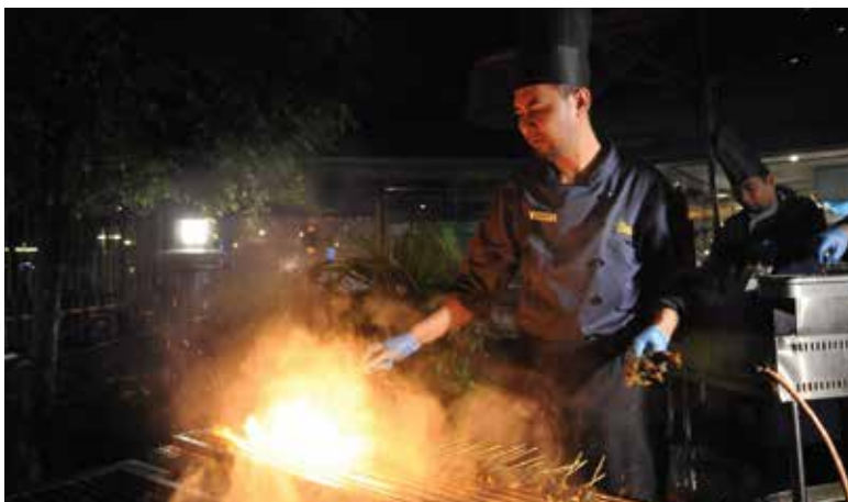
Popular satay station

The buffet offerings in its fifteen years running, will be made available for 29 evenings at the club from May 6th to June 4th 2019. More than 300 variety of dishes including TGCR Signatures - Aneka Sup Besen & Warung Gulai Kawah, fragrant charcoal barbeque grills, delightful “live action” food stalls and scrumptious desserts are spread throughout the club premises which is able to cater for 2,300 pax per evening. A favourite venue for families, friends and colleagues to gather in the holy month, in a perfect environment with great food and great dining experience. Ample parking, shuttle services and surau facilities with an Imam to conduct Tarawih prayers, presents convenience; whilst traditional ghazal entertainers and picturesque decorations compliments the mood. TGCR cookies are also available for purchase throughout the holy month.