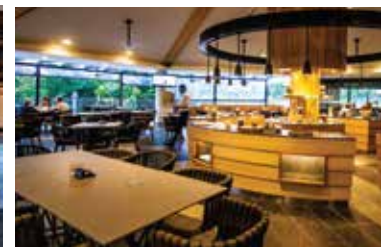
Twenty 7 Restaurant

GF, Main Wing Tel: 03 7804 8888 ext 306 Open Daily: 11.30am - 10.30pm