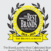
The Brand Laurette Most Celebrated Brand Award 2015-2016 For Lifestyle Golf