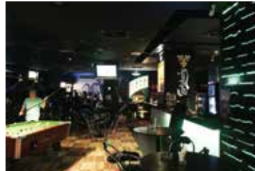
Havana Lounge & Havana Cozy

LG, Sports Wing Tel: 03 7804 8888 ext 327 Mon - Fri: 3pm - 11pm Sat - Sun: 10am - 11pm