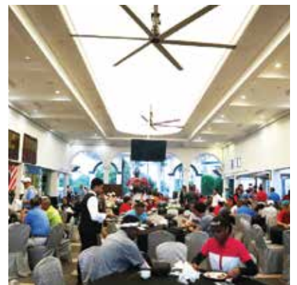
Post-competition luncheon at Golfers' Terrace