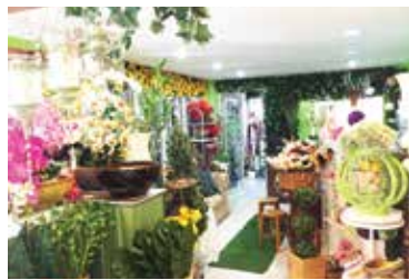
The Green House Florist

LG, Main Wing Tel: 03 7804 8888 ext 318 017 314 6754 Closed on weekends & PH Mon - Fri: 8am - 3pm