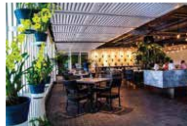
The Palm Coffee House

GF, Main Wing Tel: 03 7880 7226 Mon - Sat: 11.30am - 2.30pm 6.30pm - 10.30pm Sun & PH: 10.30am - 2.30pm 6.30pm - 10.30pm