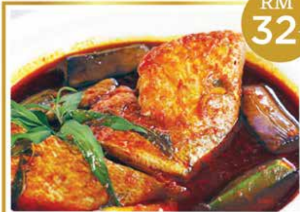
CLAYPOT ASAM PEDAS IKAN MERAH