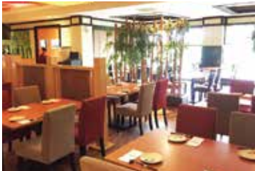
Gin Shui Tei Japanese Restaurant

LG, Sports Wing Tel: 03 7804 8888 ext 327 Mon - Fri: 3pm - 11pm Sat - Sun: 10am - 11pm