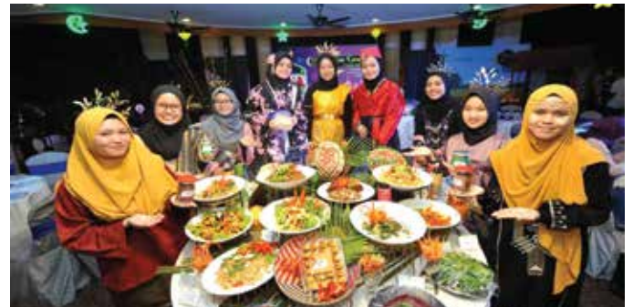
9 of the main signature dishes