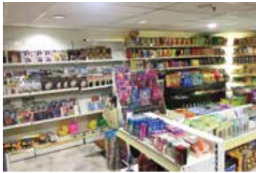
Alam General Store

GF, Walkway Tel: 03 7804 3095 Open Daily: 10.45am - 9pm